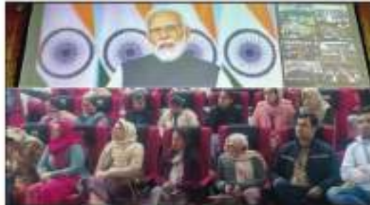
Students of GDC Kishtwar alongwith the staff attending a programme on Wednesday.

The event featured Prime Minister's live speech, providing students with insights into semiconductor chip manufacturing initiatives