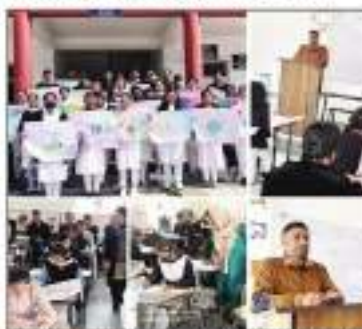
Glimpses of celebration of World Water Day on Friday.