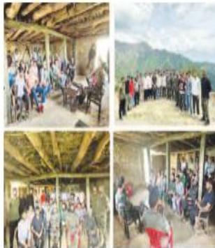
Bakarwals at Gambhir Mughlan, Rajouri.

To give wings to the dreams of these enthusiasts, Indian Army organized a career counselling session for Gujjar and