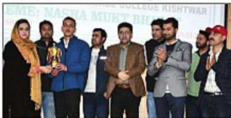
Dignitaries present during the District Level Neighbourhood Youth Parliament on Saturday.

The programme witnessed participation of hundreds of youth belonging to different parts of the district. The event started with the traditional lamp lightening ceremony followed by the welcome